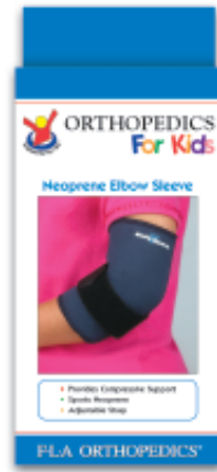
Neoprene Elbow Sleeve