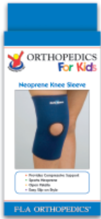
Neoprene Knee Sleeve