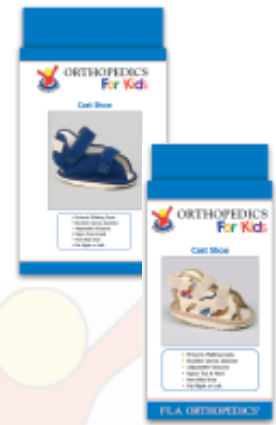
Canvas Rocker Bottom Cast Shoe

Model: 43-101 Color: Ped. Print, Navy* HCPCS: L3260