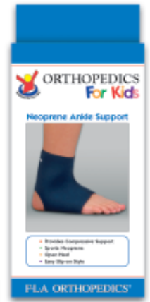
Neoprene Ankle Support