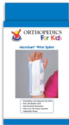
Microban® Wrist Splint