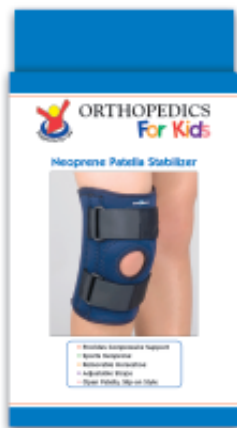
Neoprene Patella Stabilizer