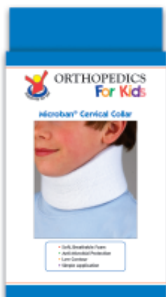
Microban® Cervical Collar

Model: 28-502 Colors: Ped. Print, Navy* HCPCS: A4565