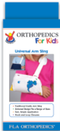
Universal Arm Sling

Model: 28-502 Colors: Ped. Print, Navy* HCPCS: A4565